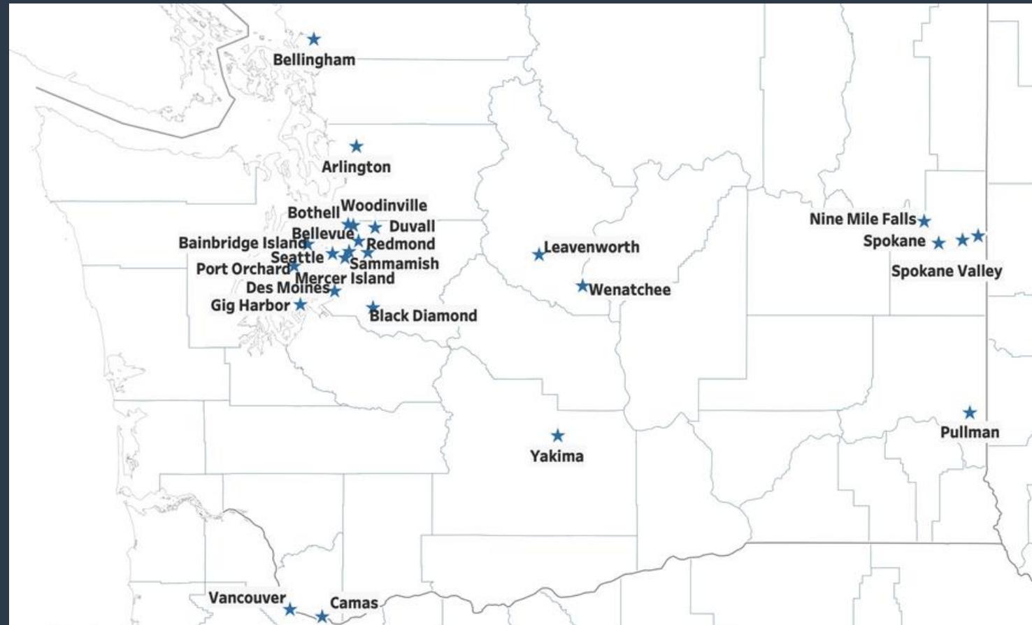
Map of 2024 applicants

The fund invests in Seed and early-stage companies who are headquartered in Washington State. The fund is industry agnostic. Eligible companies cannot have raised more than two million in investment to date (grant funding not included).